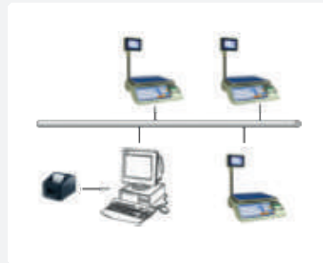
Ethernet network system